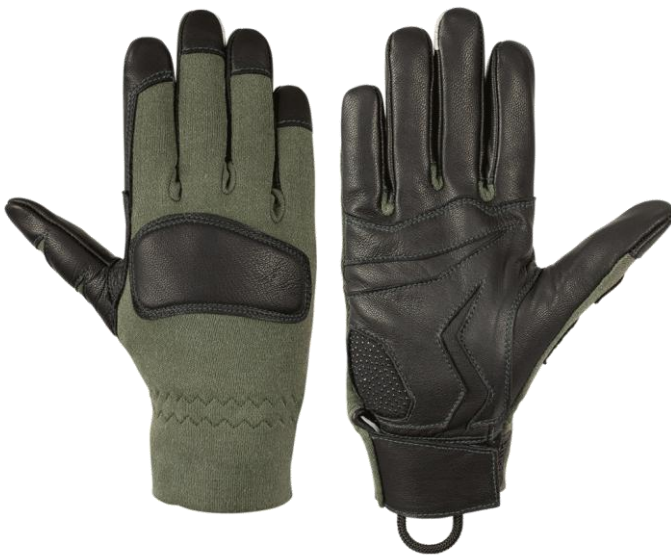
Anika Short Green