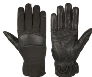
Anika Quick Black